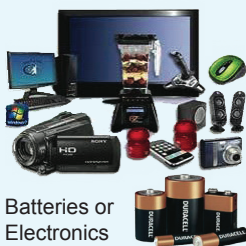
Batteries or Electronics