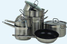
Pots & pans