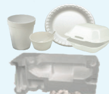
Polystyrene foam containers, peanuts and packing