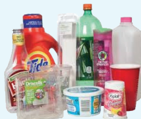
Clean plastic containers Plastics #1, #2, #4, #5, & #7 See bottom of container for #