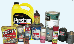
Hazardous or toxic product containers