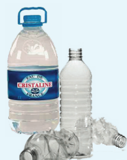
Empty plastic bottles