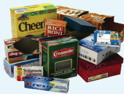
Boxboard, cereal boxes, dry food boxes