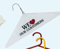
Plastic & metal hangers