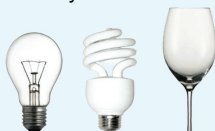
Light bulbs, drinking glasses, other glassware