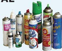
Empty Aerosol cans