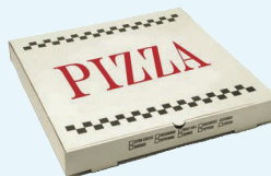
Take out pizza boxes free of food residue