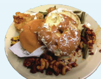
Food & wet waste, food contaminated paper & napkins