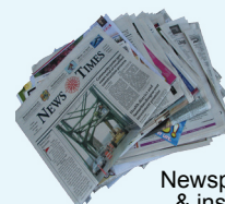
Newspaper & inserts