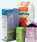
Empty wax-coated paper containers and juice boxes