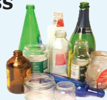
Clean glass jars & bottles