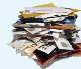
Mail, mixed paper, magazines and catalogs