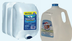
Empty plastic jugs